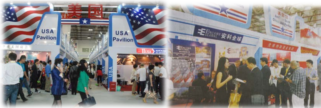
2013 USA Pavilion (IIUSA/AmCham) Layout